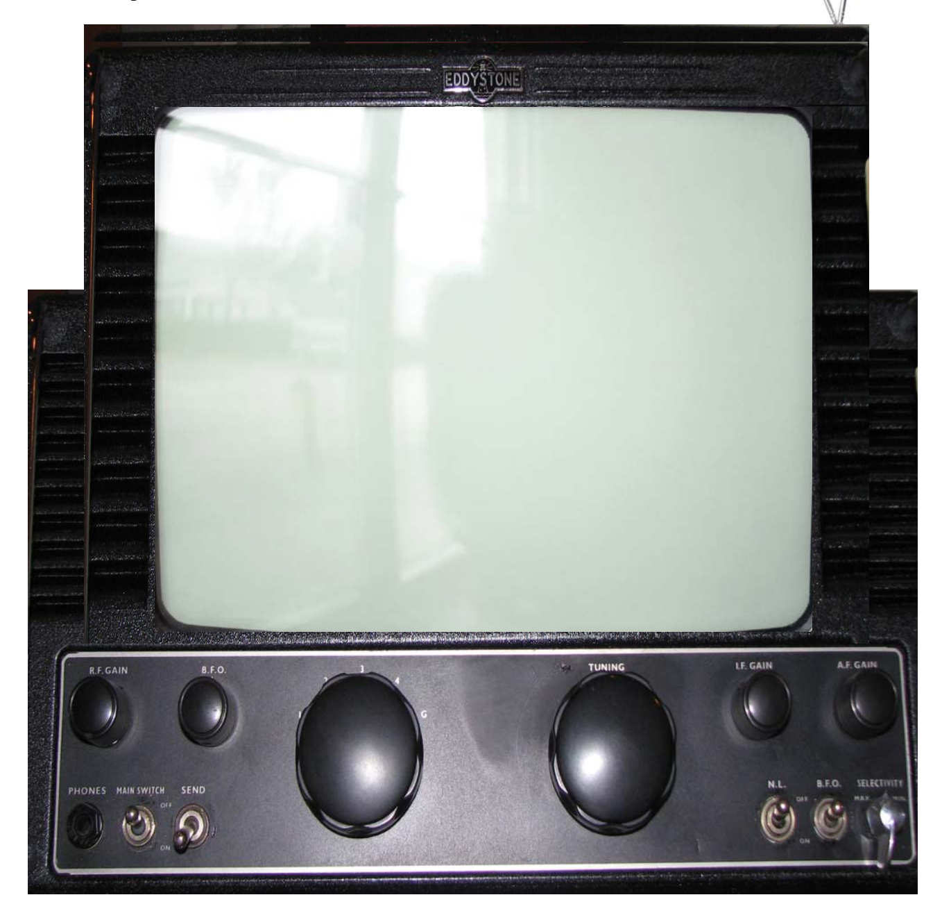
Above: The set after initial clean-up – what a find!