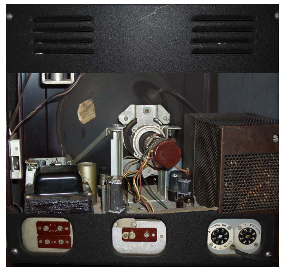
Above: View through rear panel – note Vibrator/S-Meter connector and pick-up input

©Gerry O'Hara, VE7GUH/G8GUH (<u>gerryohara@telus.net</u>), Vancouver, BC, Canada, April 1, 2010