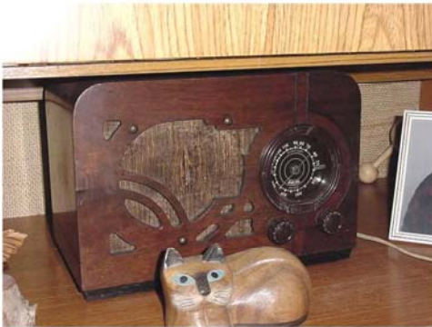
Gerry O'Hara's collection of restored radios; clockwise from the top: Eddystone S770R Two Philcos and a GE console Eddystone S740 Eddystone S740 with homebrew S meter Detrola and Crossley Detrola and Crossley